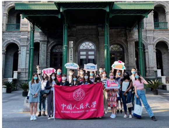
Trip to the old campus on Zhangzizhong Road

Field Trips can promote more understanding of Chinese firms and economy and build connections for students who wish to work in China.