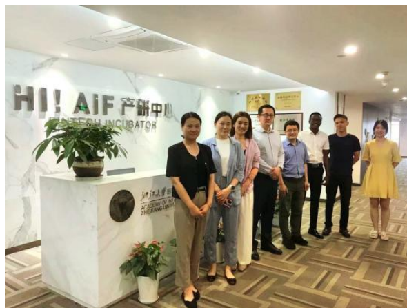
Visiting the Academy of Internet Finance, Hangzhou