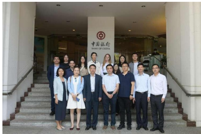
Singapore FinTech Trip