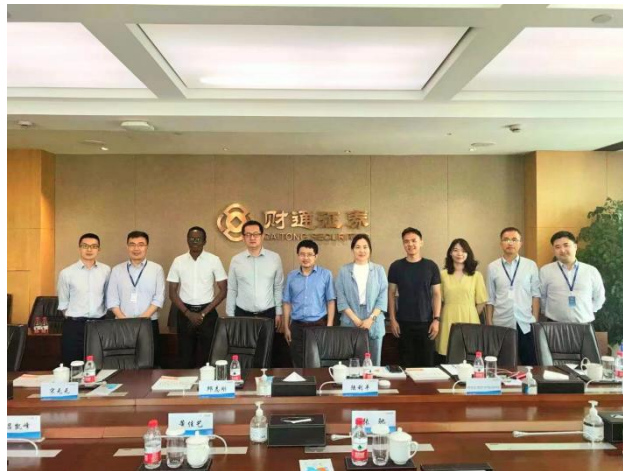
Hangzhou FinTech Trip