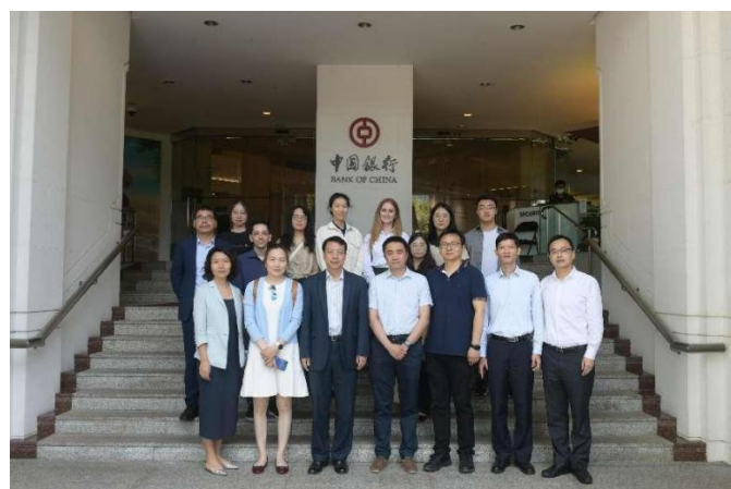
Singapore FinTech Trip