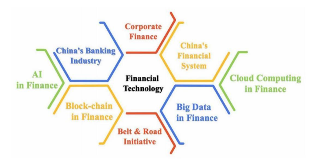
*Courses are subject to mild changes