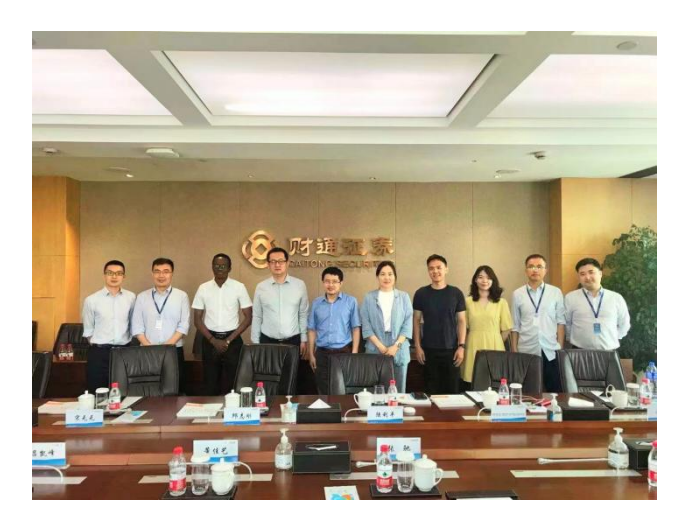
Hangzhou FinTech Trip