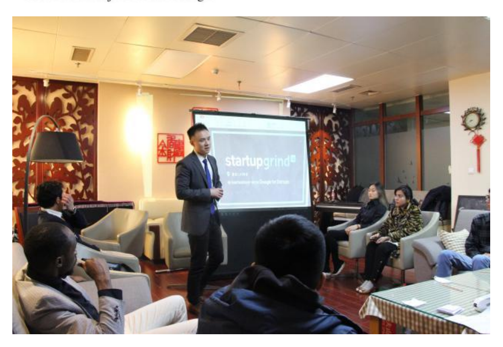
Extended Learning and Activities