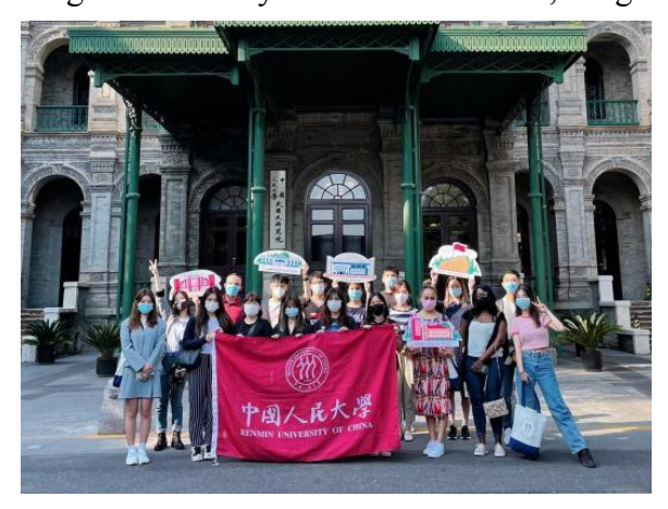
Trip to the old campus

Field Trips can promote more understanding of Chinese firms and economy and build connections for students who wish to work in China.