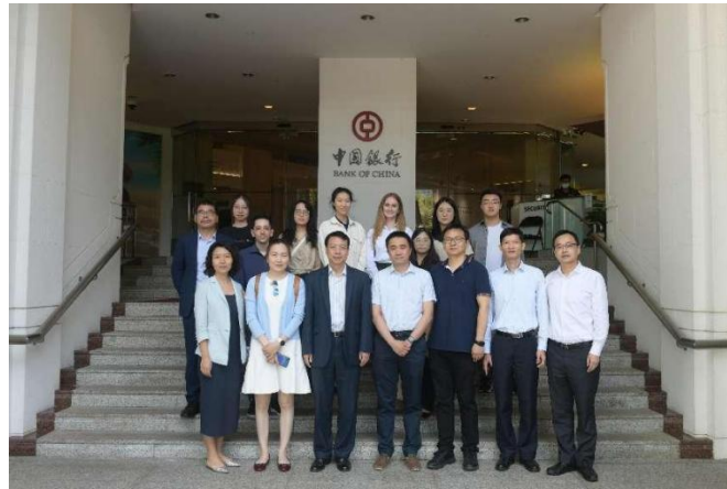
Singapore FinTech Trip