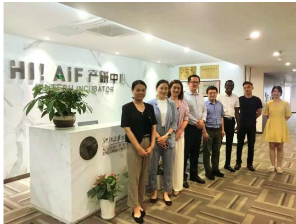
Visiting the Academy of Internet Finance, Hangzhou