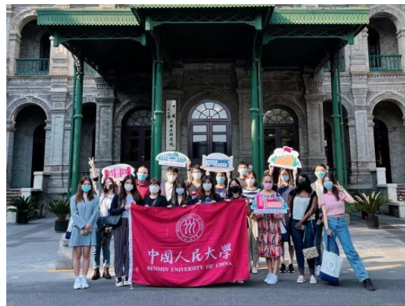
Trip to the old campus

Field Trips can promote more understanding of Chinese firms and economy and build connections for students who wish to work in China.